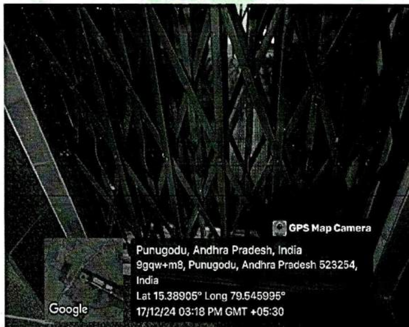
Fig: Lift For Physically Disabled Persons