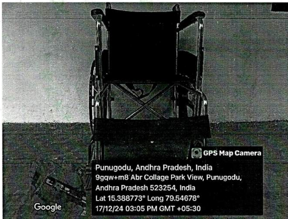
Fig: wheel chair for Physically Disabled Person