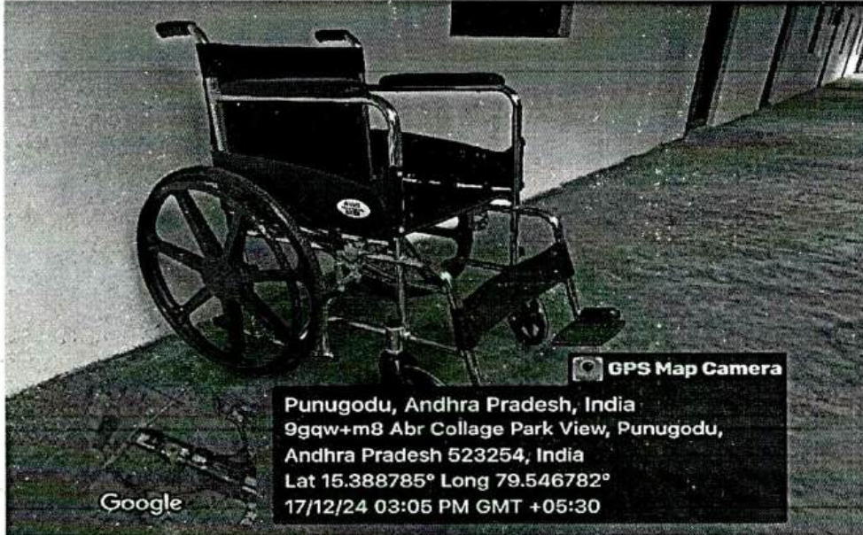
Fig: wheel chair for Physically Disabled Person