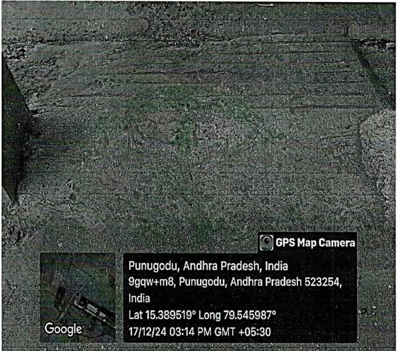
Fig: Ramp for Physically Disabled Person