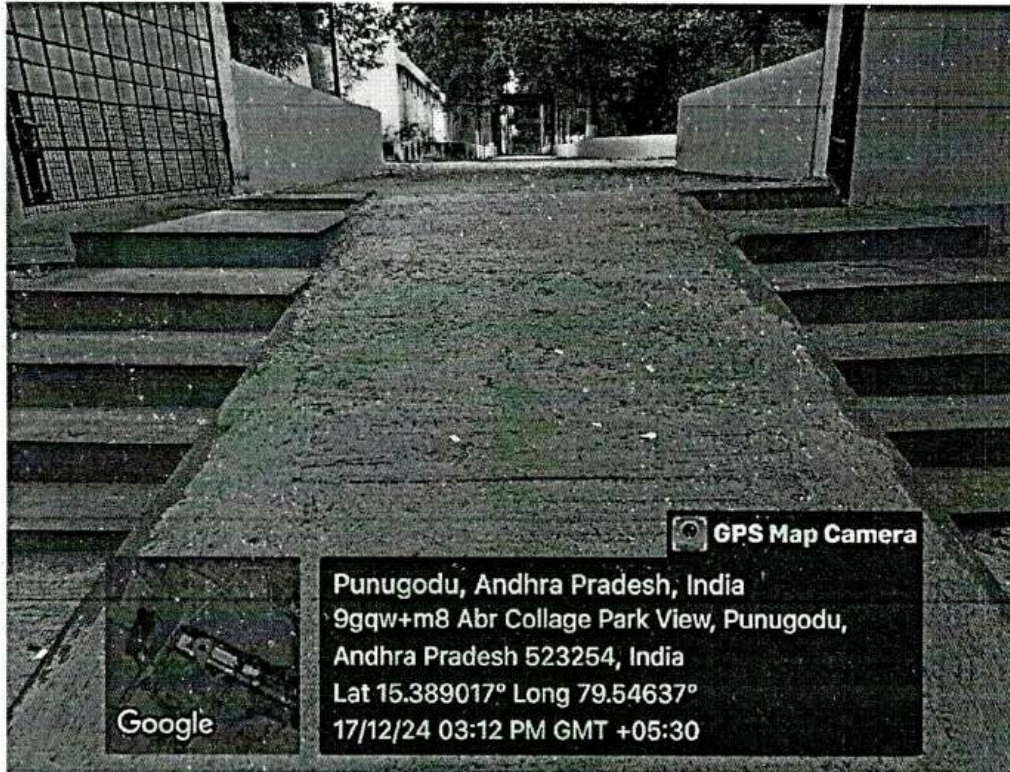
Fig: Ramp for Physically Disabled Person